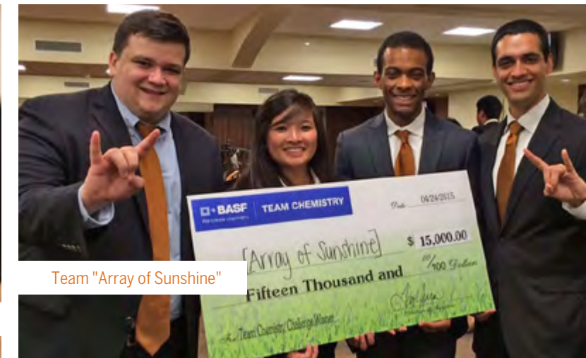
Team "Array of Sunshine"