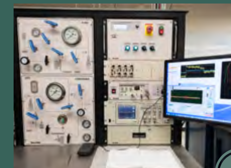
Control Panel of the Triaxial Frame – Controls pressure and stress with several hydraulic intensifiers and collects geophysical information in real-time such as ultrasonic velocity