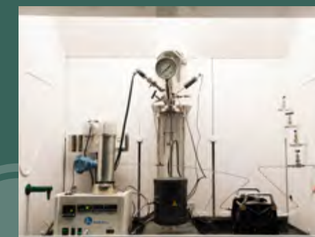
Pressure Reactor – Exposes rock samples to temperature, pressure and chemical conditions representative of CO 2 geologic storage to measure the mechanical stability of rock minerals