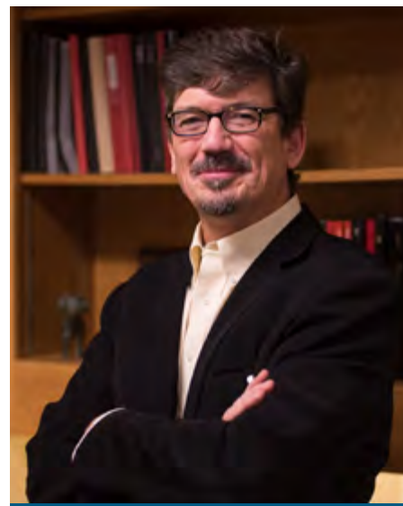
BY JON OLSON, CHAIR, UT PGE

A digital version of the magazine can be viewed at pge.utexas.edu/news